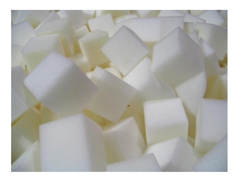
Figure 1. Waterloo Biofilter foam filter media

The Waterloo Biofilter is an attached growth biological trickling filter. Sanitary wastewater from the residence is collected in the pre-treatment tank where the sewage settles and anaerobic bacteria begin the treatment process. Pre-treatment tank effluent is pumped to the Waterloo Biofilter treatment unit. The absorbent foam filter medium within the treatment unit creates an ideal environment for microbial growth and attachment. Beneficial bacteria colonize the interior surfaces of the filter medium where they are protected from predators, desiccation, and freezing. These microbes degrade and oxidize organic pollutants, coliform bacteria, ammonium, and other contaminants as the wastewater is retained in the filter medium by capillarity. Air passively circulates throughout the filter media providing an aerobic treatment environment without the need for forced aeration. The Waterloo Biofilter provides both physical filtration and biological treatment of wastewater in one step – ensuring high levels of pollutants are removed before water is returned to the natural environment.