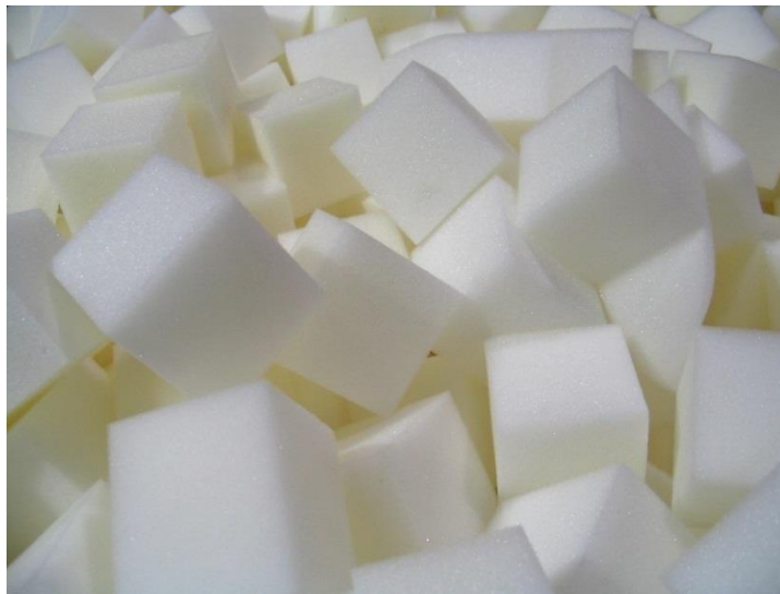
Figure 1. Waterloo Biofilter foam filter media

The Waterloo Biofilter is an attached growth biological trickling filter. Sanitary wastewater from the residence is collected in the pre-treatment tank where the sewage settles and anaerobic bacteria begin the treatment process. Pre-treatment tank effluent is pumped to the Waterloo Biofilter treatment unit. The absorbent foam filter medium within the treatment unit creates an ideal environment for microbial growth and attachment. Beneficial bacteria colonize the interior surfaces of the filter medium where they are protected from predators, desiccation, and freezing. These microbes degrade and oxidize organic pollutants, coliform bacteria, ammonium, and other contaminants as the wastewater is retained in the filter medium by capillarity. Air passively circulates throughout the filter media providing an aerobic treatment environment without the need for forced aeration. The Waterloo Biofilter provides both physical filtration and biological treatment of wastewater in one step – ensuring high levels of pollutants are removed before water is returned to the natural environment.